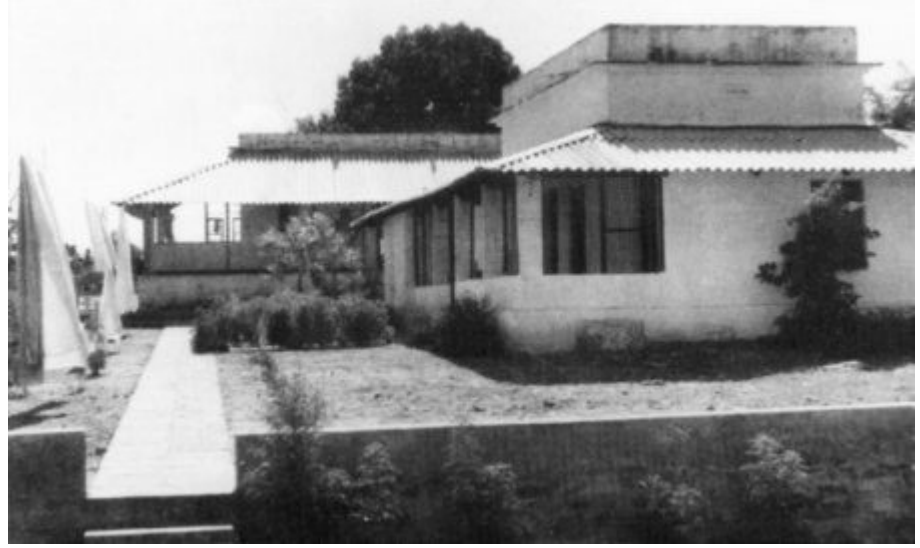
The yagnashala at the ashram.