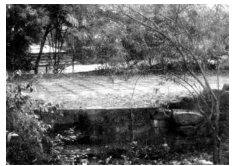
The platform under which the temple, idols and artefacts were excavated by the Archaeological Department.