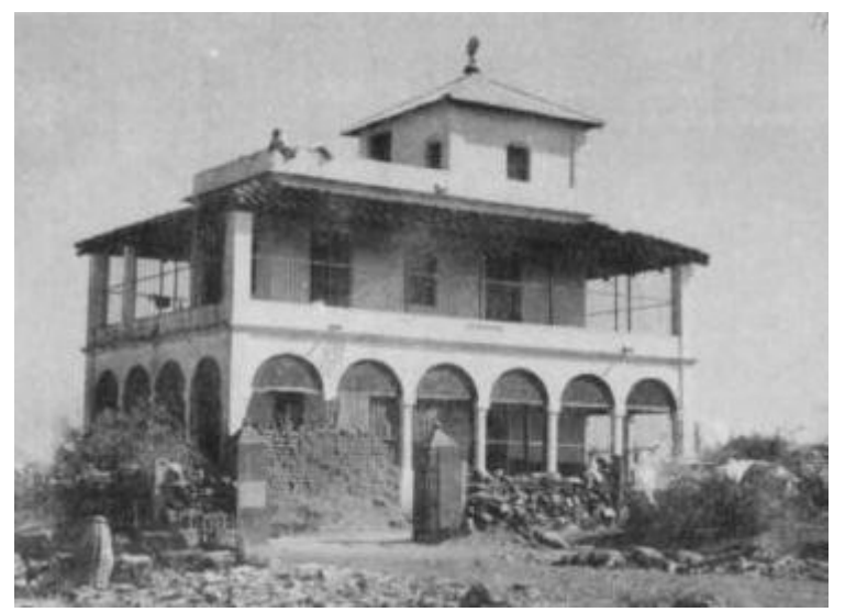
Ashram building with Sri Ma's room on top.