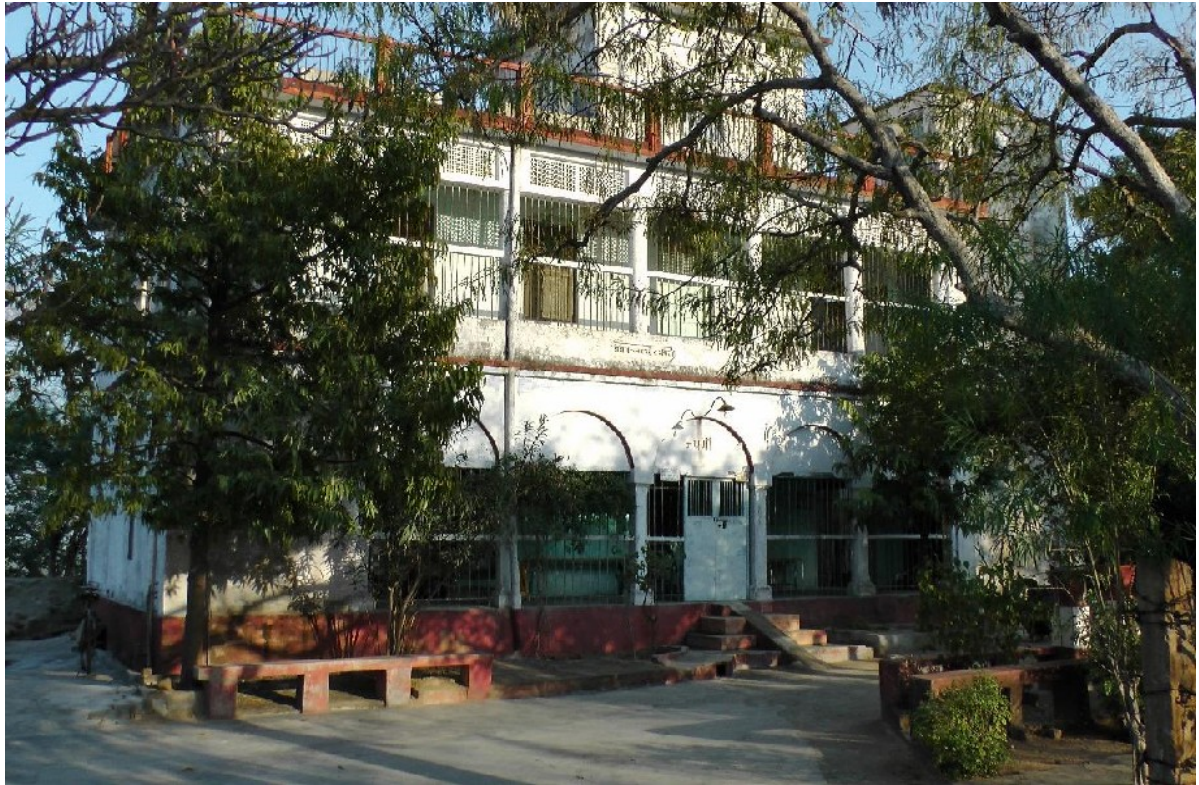
Vindhyachal Ashram today.