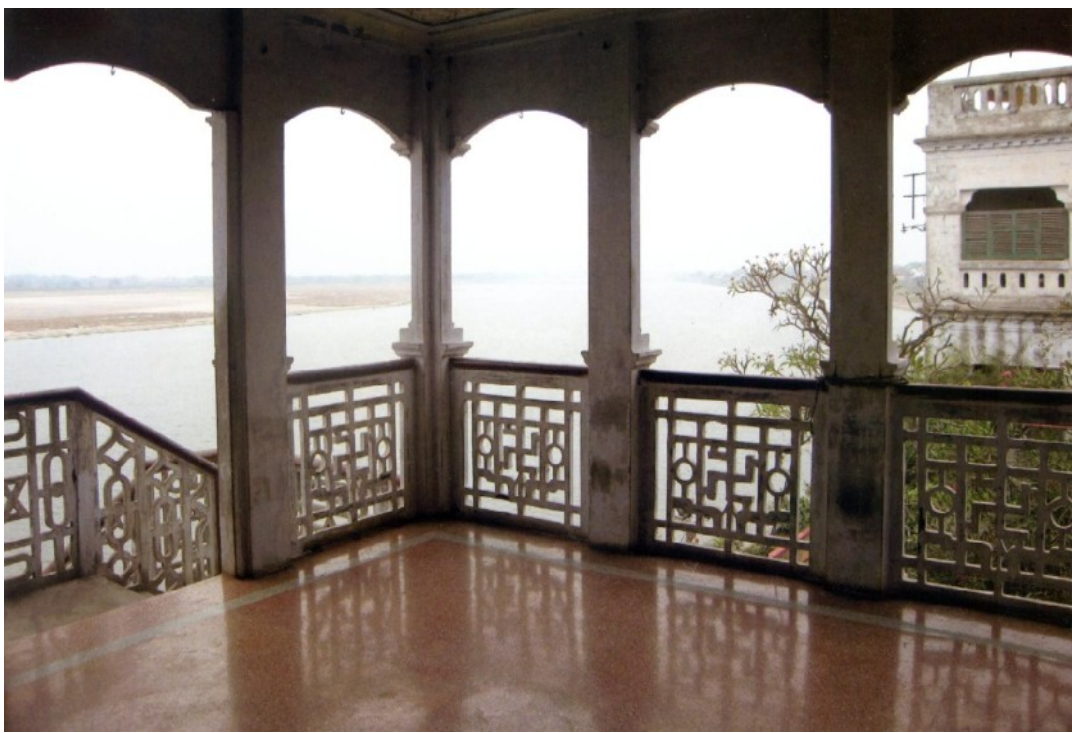
View of the Ganga from outside the Annapurna Temple