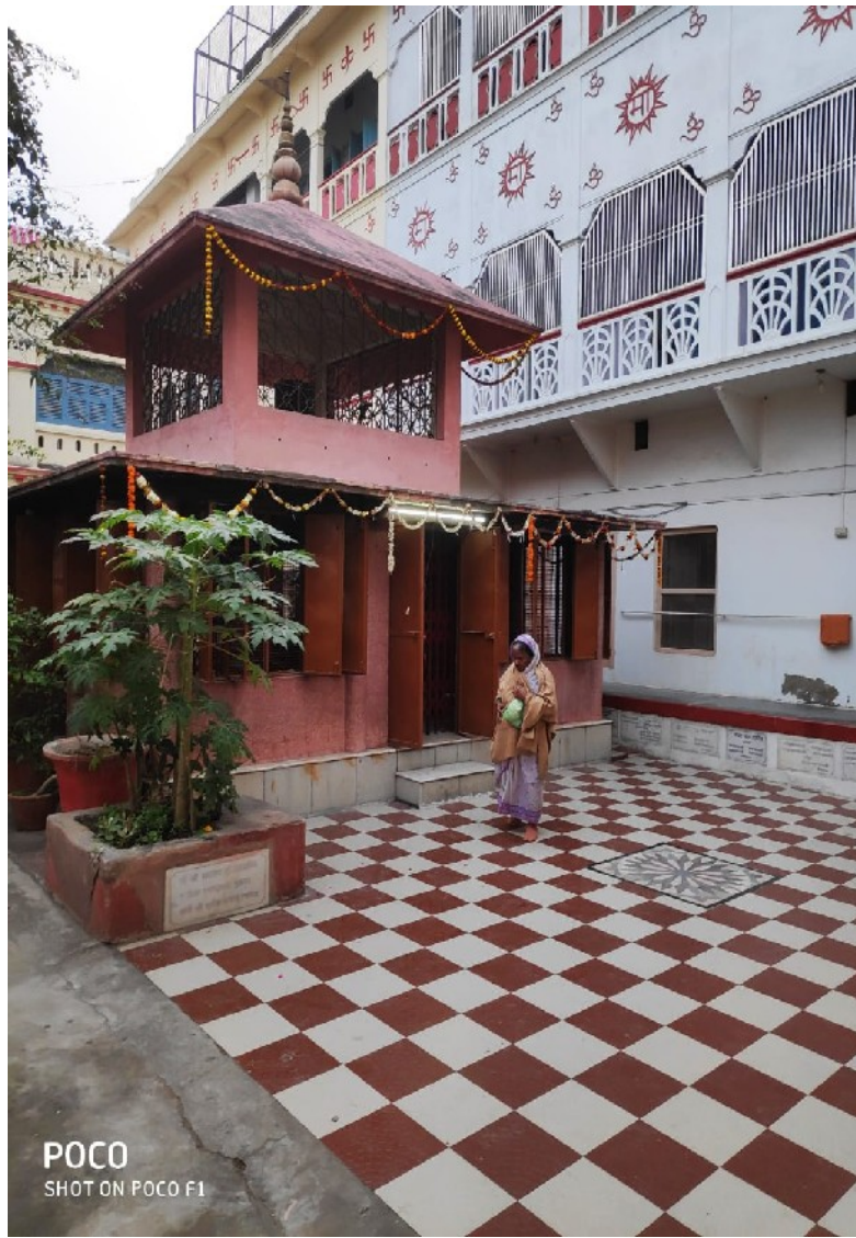
Yagnashala in the ashram courtyard