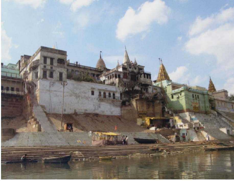
View of the ashram from the River Ganga