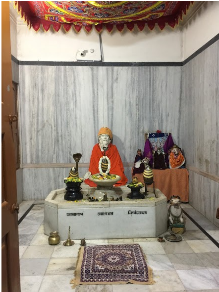
Monument to Baba Bholanath (Sri Ma's husband)