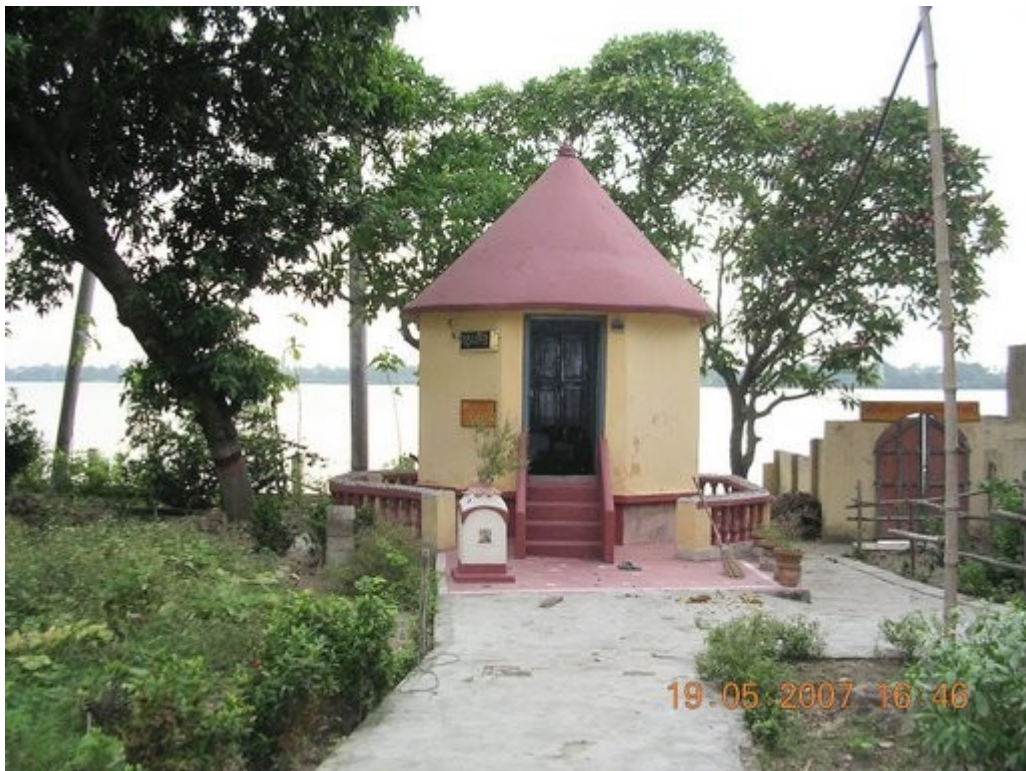
Japa kutir, on the banks of the river.