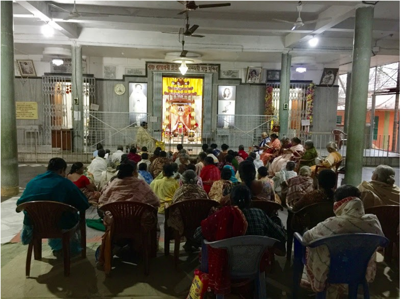
Inside the Satsang Hall