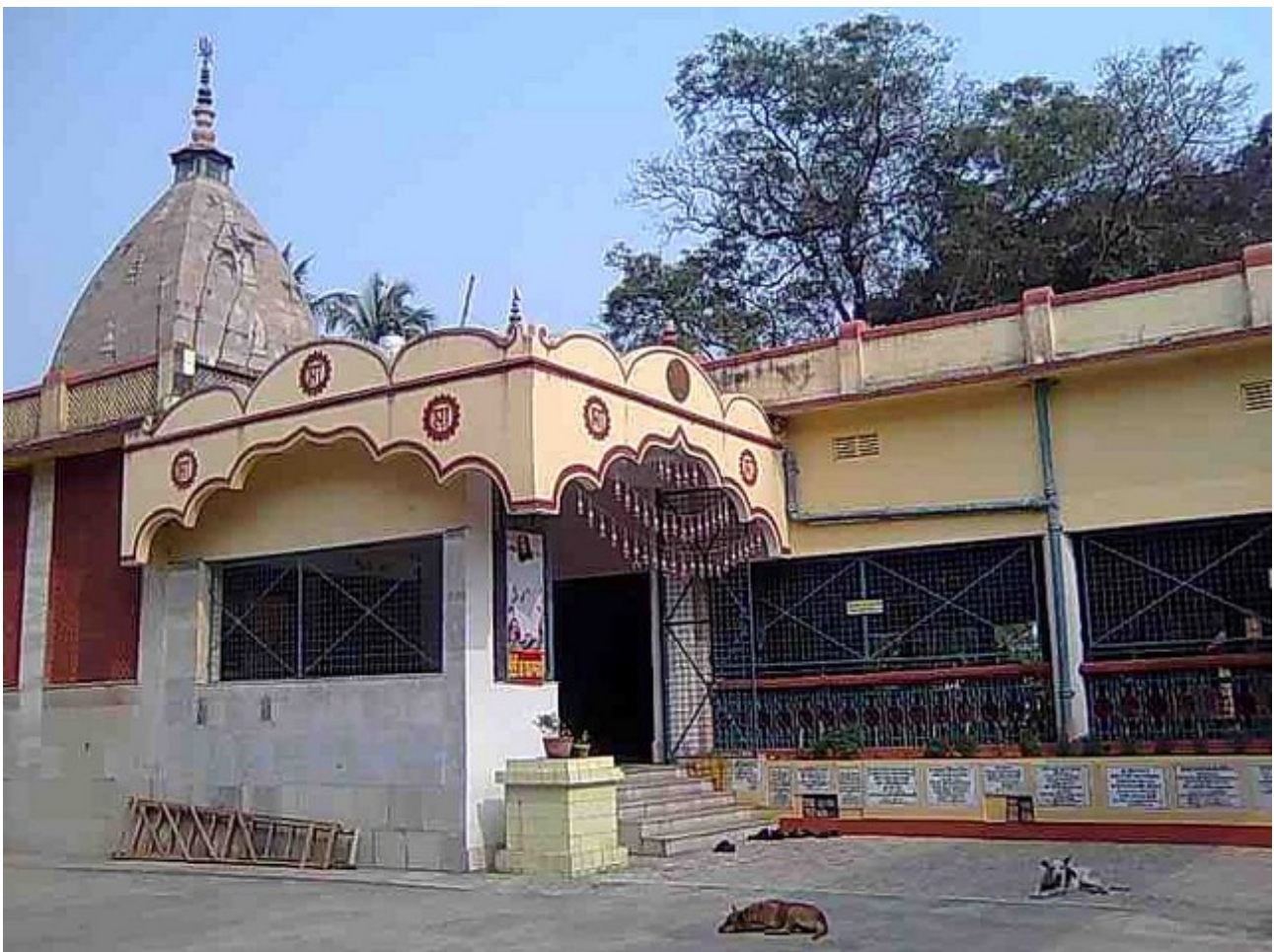
Entrance to the Satsang Hall and Temple

Aerial view of Agarpara Ashram showing the Hooghly River on the left, ashram buildings left centre and the large pond in the middle.