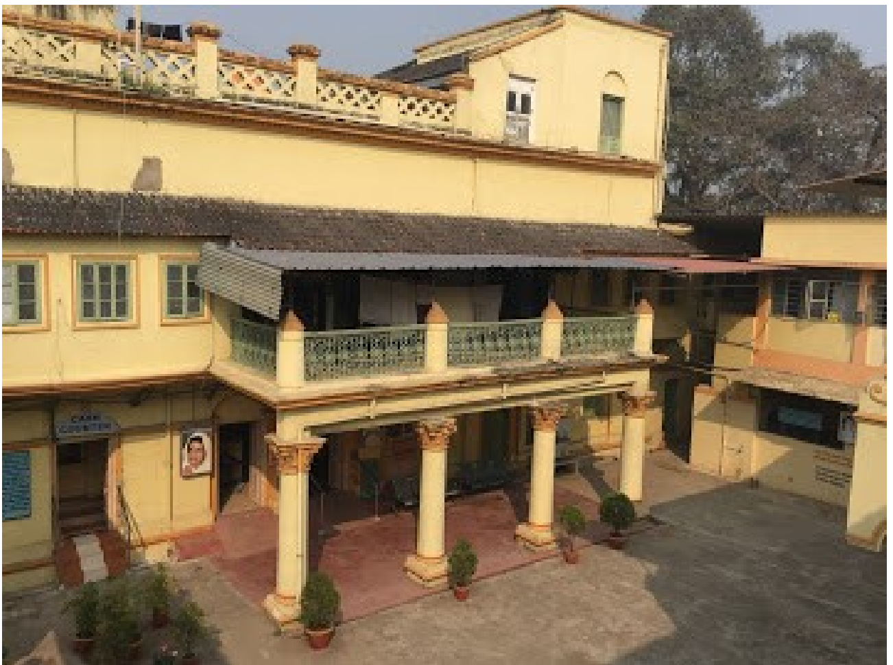
Main Ashram building