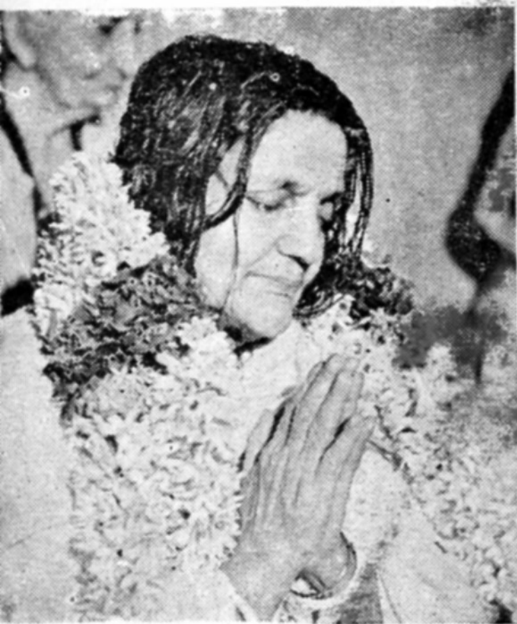
Reception of Mataji in Madras